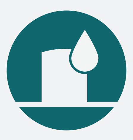
WHAT IS SKIM OIL?

A disposal well is different from a producing oil well because it does not deplete in production over time. A disposal well can improve over time because the wells around it will extract more water the longer they produce. The amount of water a disposal well receives can increase as more wells are drilled in the area. Rising oil prices can make the disposal well more profitable since skim oil prices fluctuate with the price of oil. Longevity is a bonus for a disposal well operation.