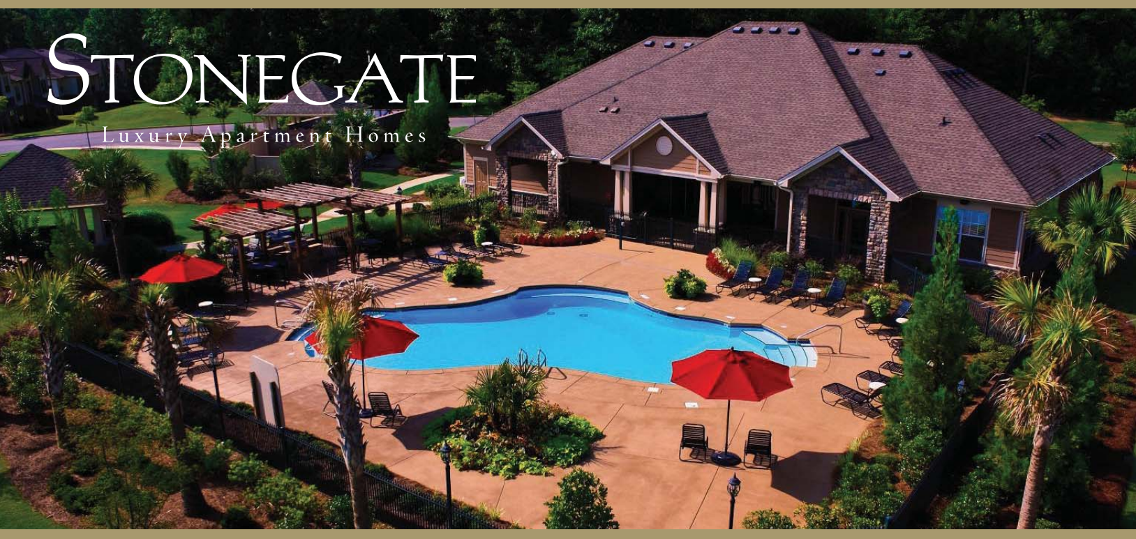
101 Leaf Lake Boulevard | Birmingham, AL 35211