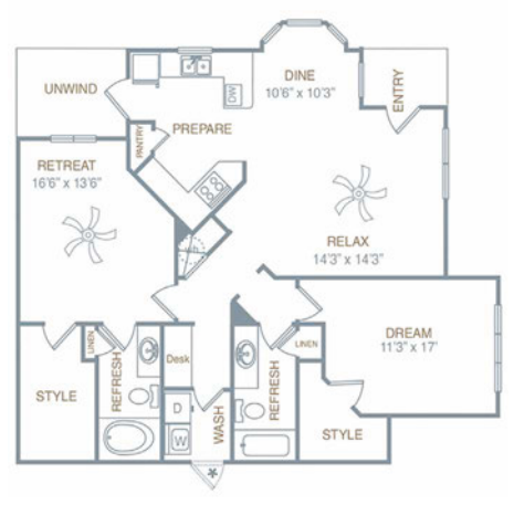
Two Bedroom | Two Bath