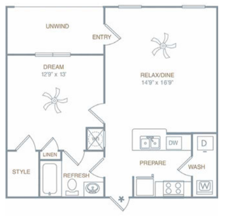
One Bedroom | One Bath