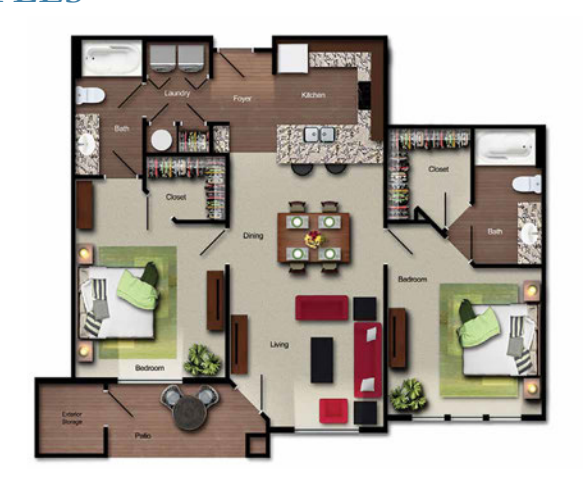
Two Bedroom | Two Bath