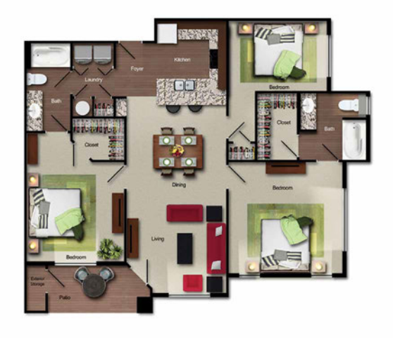
Three Bedroom | Two Bath