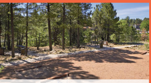
BEAUTIFUL, CONVENIENT LOCATION