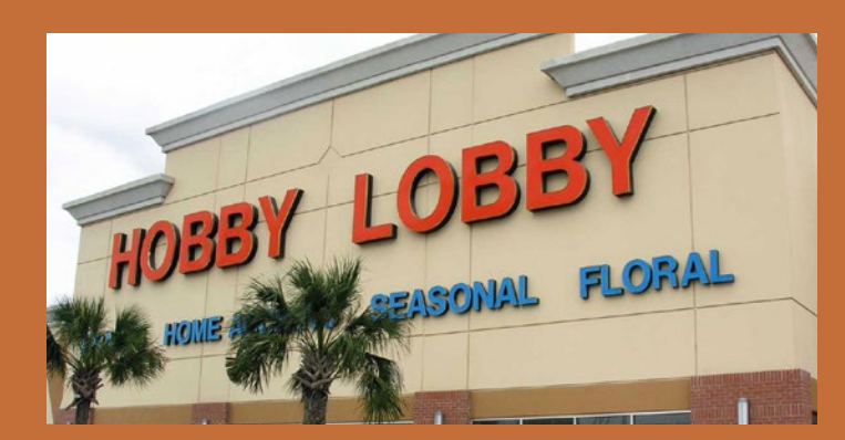
INCREASE IN ANNUAL REVENUE: 8.1% ESTIMATED NUMBER OF EMPLOYEES: 28 THOUSAND