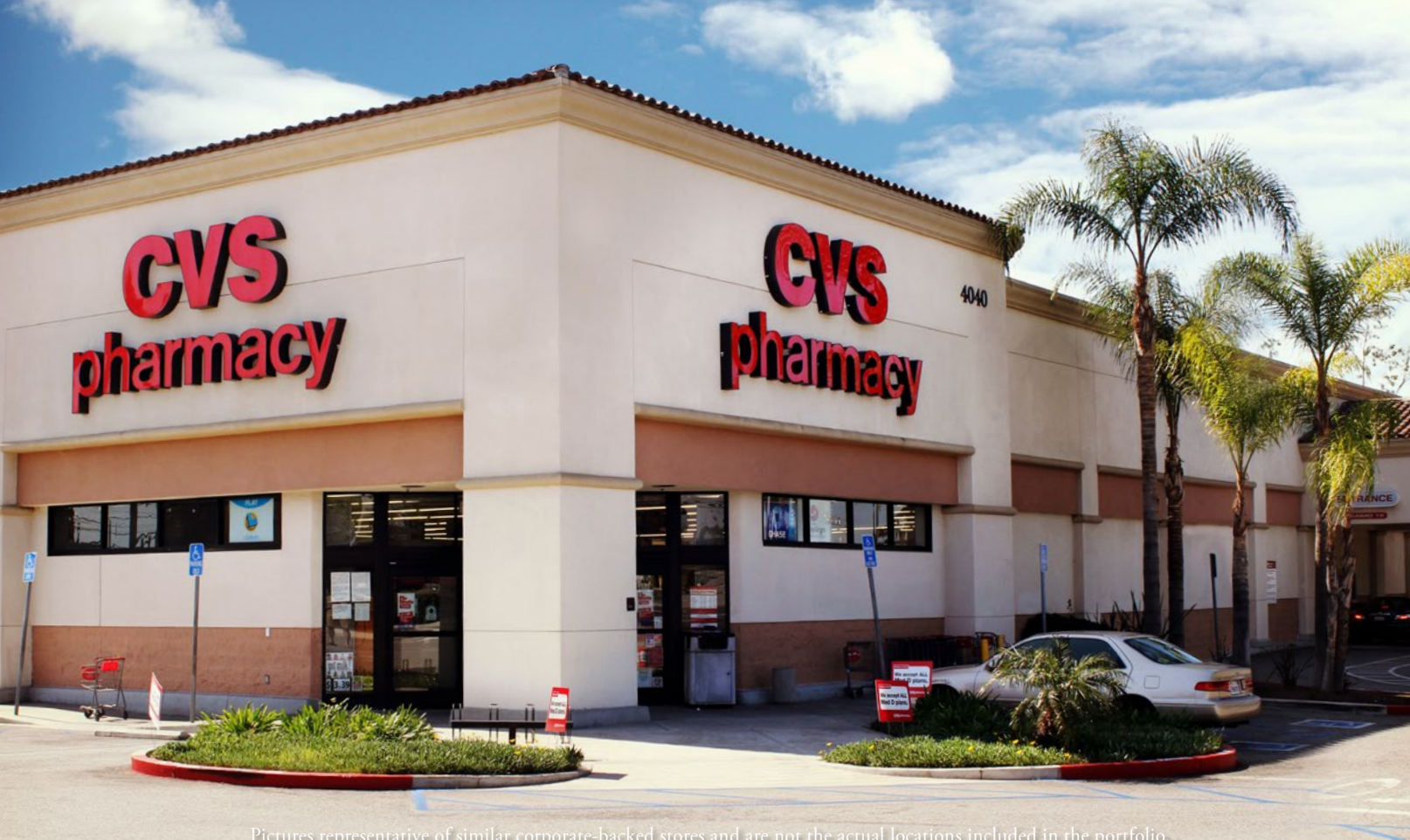
Pictures representative of similar corporate-backed stores and are not the actual locations included in the portfolio.