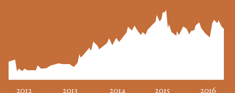
NYSE: AAP - 5-Year Stock Performance

CURRENT ANNUAL NET INCOME: $473.40 MILLION